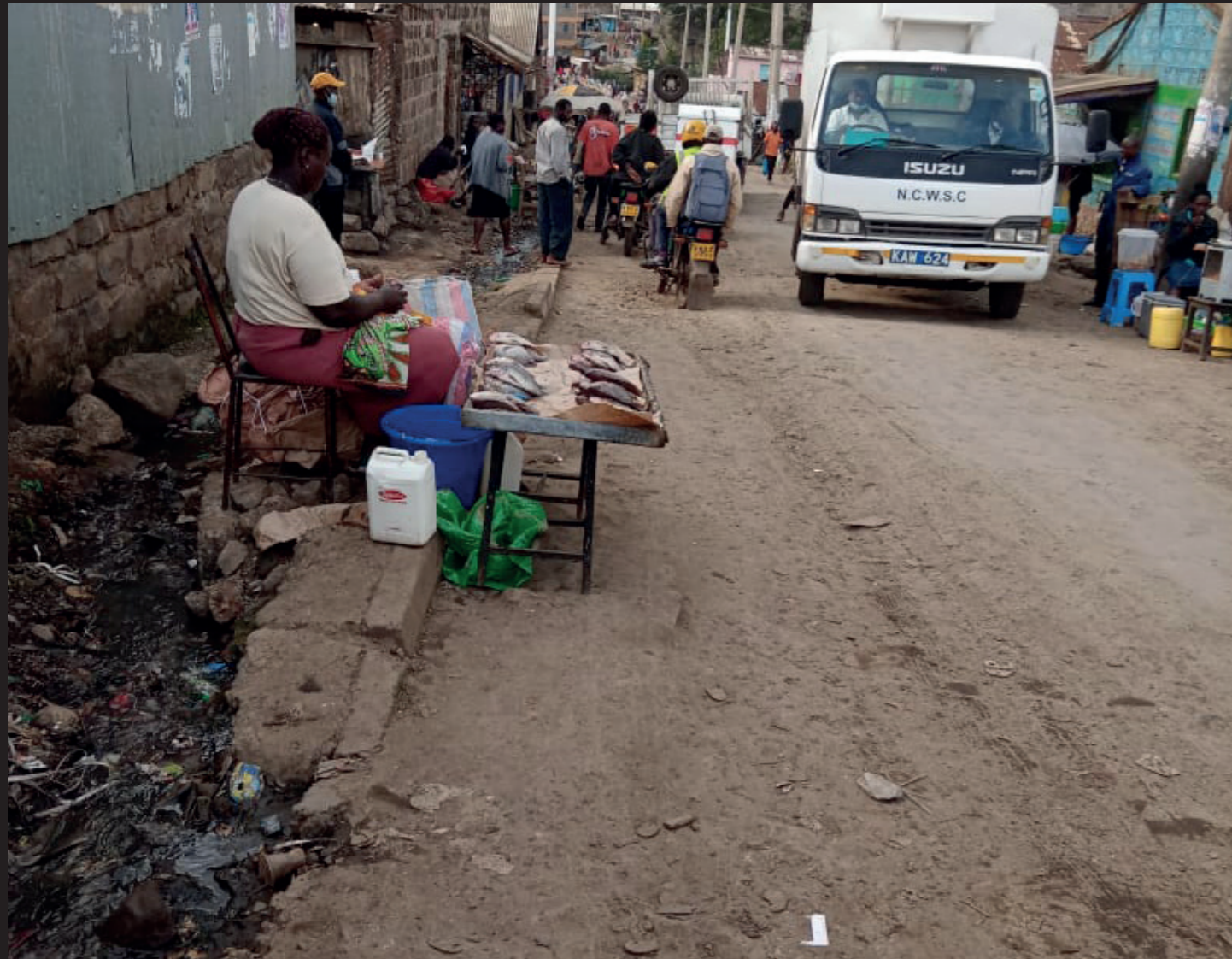
MIRIAM IS A DEAF PERSON LIVING IN KOROGOCHO INFORMAL SETTLEMENT

I don't feel safe while am walking. This makes it very risky for us deaf people to walk on the road. If I want to go somewhere I must plan my route first.