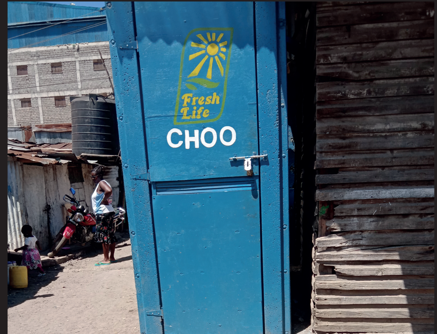
JECINTA IS A CHILD HEADING A HOUSEHOLD LIVING IN VIWANDANI INFORMAL SETTLEMENT

We are supposed to pay for it but we lack money... We can use it on credit but sometimes we find he has left a person there who can't accept credit.