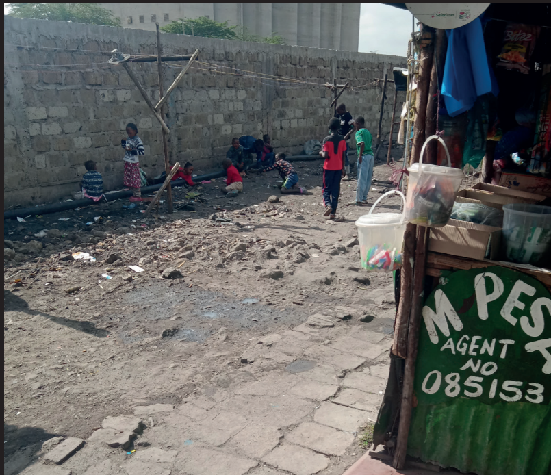
MIRIAM IS A DEAF PERSON LIVING LIVING IN KOROGOCHO INFORMAL SETTLEMENT

pass by my house to my neighbors place. The wires are not high enough. Outside my house the wires sometimes stretch from a pole and touch, producing sparks when it rains.